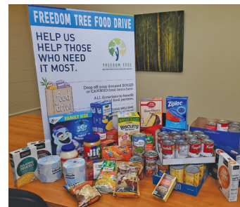
The TCCU Hillsboro staff created a lobby display of some of this year's Freedom Tree donations.

Thanks again to everyone for your generous support!