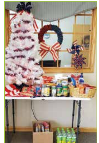
A portion of Freedom Tree donations in the Hillsboro branch illustrates the community's willingness to give.

Thanks again to everyone for your generous support!